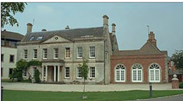
Haywardsend House in 2000