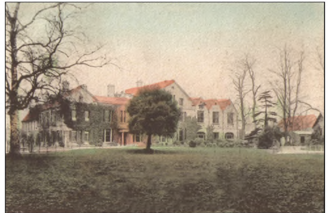
Haywardsfield Hall from a water colour 1865