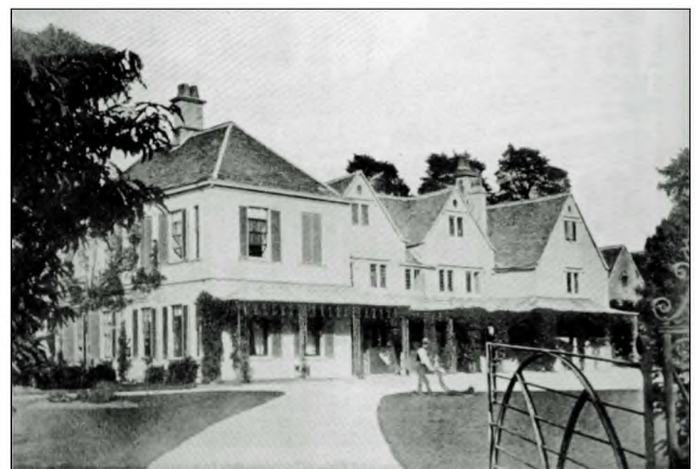
Haywardsfield Hall 1882