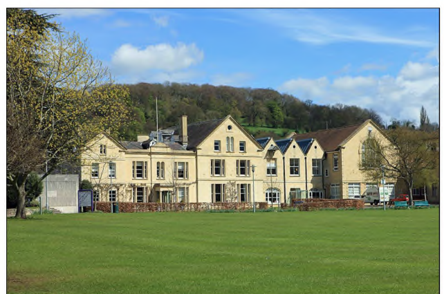
Wycliffe College School House 2012