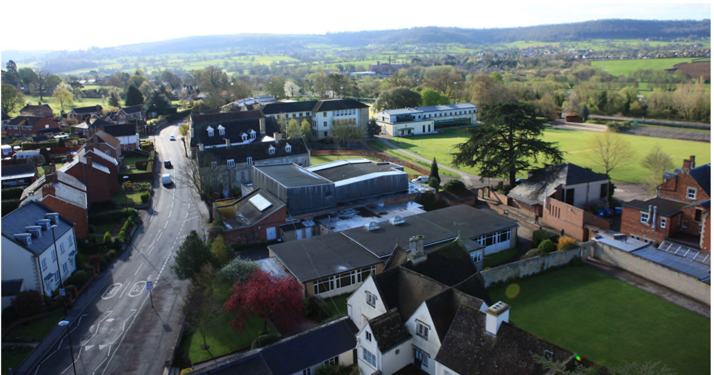
View across the Wycliffe College campus from the top of the Chapel spire.