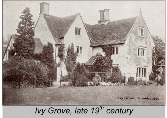
Ivy Grove, late 19 th century

A house called Middlemore's was a medieval freehold of Stonehouse manor, probably timber-framed. It was part of the Robbins family estates which later came to the Selwyns, with a share of considerable lands. The tenants were the Dangerfield family, yeoman farmers but also involved in cloth, with their occasional sub-tenants. They rebuilt the house in stone in the early 17 th century.