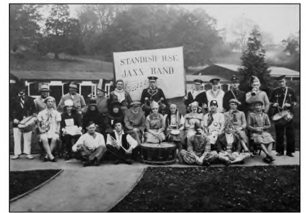
Standish House jazz band