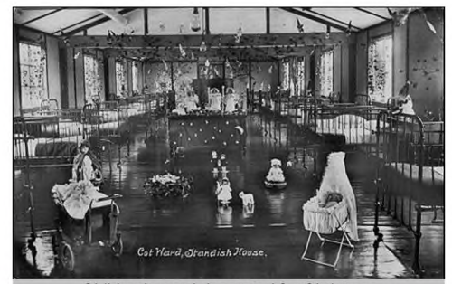
Children's ward decorated for Christmas