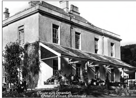
House with Verandah Standish House, Stonehouse