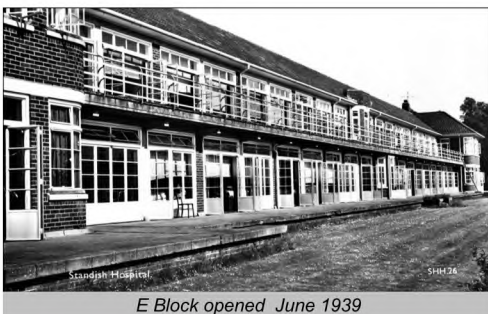
E Block opened June 1939