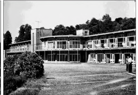
Standish Hospital, E Block

In 1922 Gloucestershire County Council bought Standish House and surrounding lands. The location made it an excellent place for a Tuberculosis Institution giving priority to ex-servicemen. With help from the Red Cross, who gave £10,000 and other contributions, the Hospital was refitted.