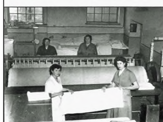
The Laundry Room.