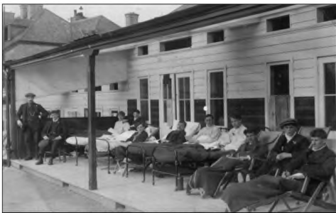
Men outside their chalets having their daily fresh air

There was a Recreation Hall and a stage with a piano. Many concerts were given. There was even a resident jazz band. Fetes were held to raise funds for equipment.