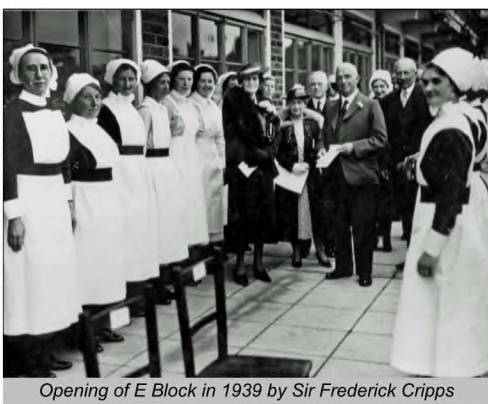
Opening of E Block in 1939 by Sir Frederick Cripps