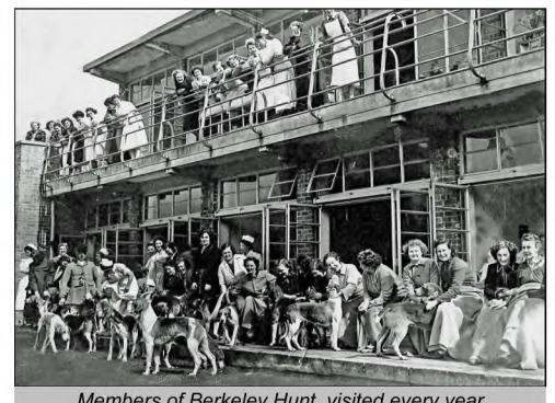
Members of Berkeley Hunt visited every year