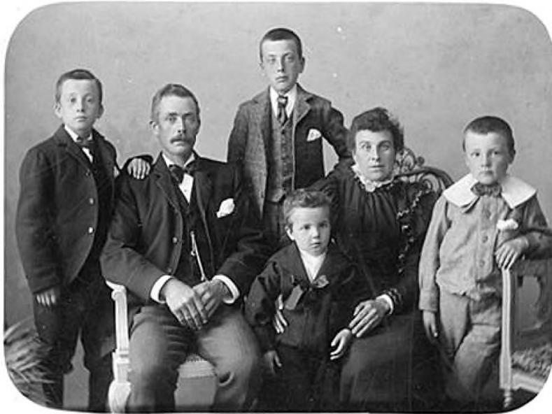
1898 - The Baker Family

In 1914 the Baker family was running the Spa Inn in Oldends Lane, Stonehouse.