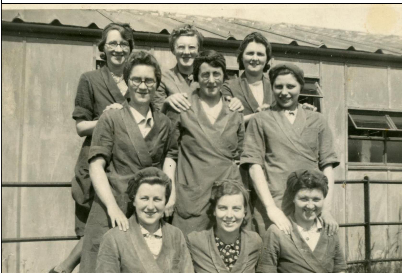
Women on war work at the Hostel.

During the war, the hostel was mainly used for women who were drafted in to work at the shadow factories.