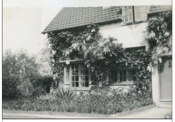
The Old Nursery house 1930s.

I remember the village shows we always entered at Stonehouse and Frocester. My mother often judged the fruit and vegetable classes."