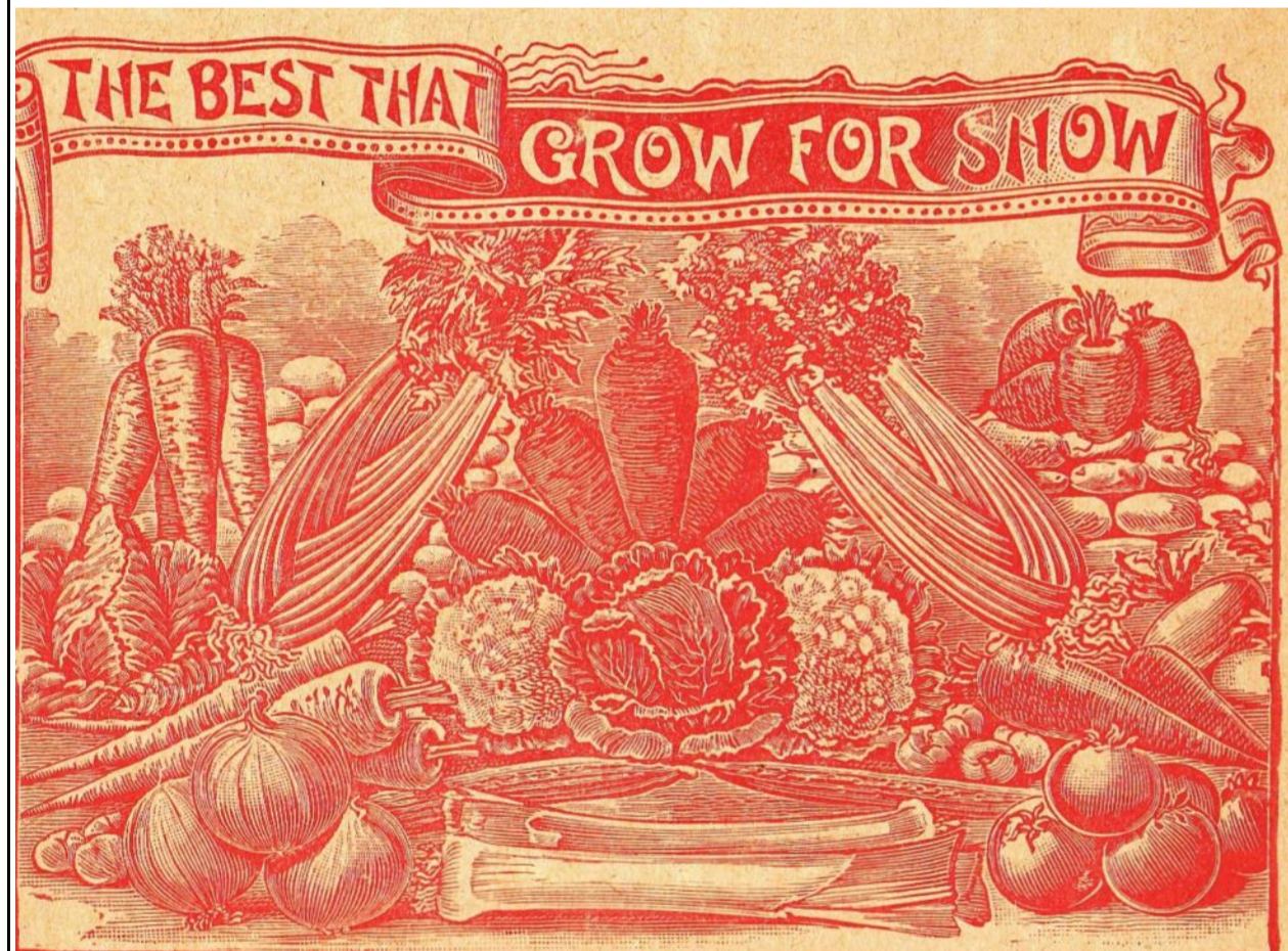
FIRST PRIZE COLLECTION GROWN AT OSBORNE BY H.M. THE KING FROM TOOGOOD'S SEEDS.

Potatoes, Peas, Beans, Parsnips, Cabbages, Cauliflowers, Carrots, Onions, Leeks, Turnips, Beet, Marrows, Celery, Radishes, Cucumbers, Tomatoes, Lettuces, Rhubarb, Herbs