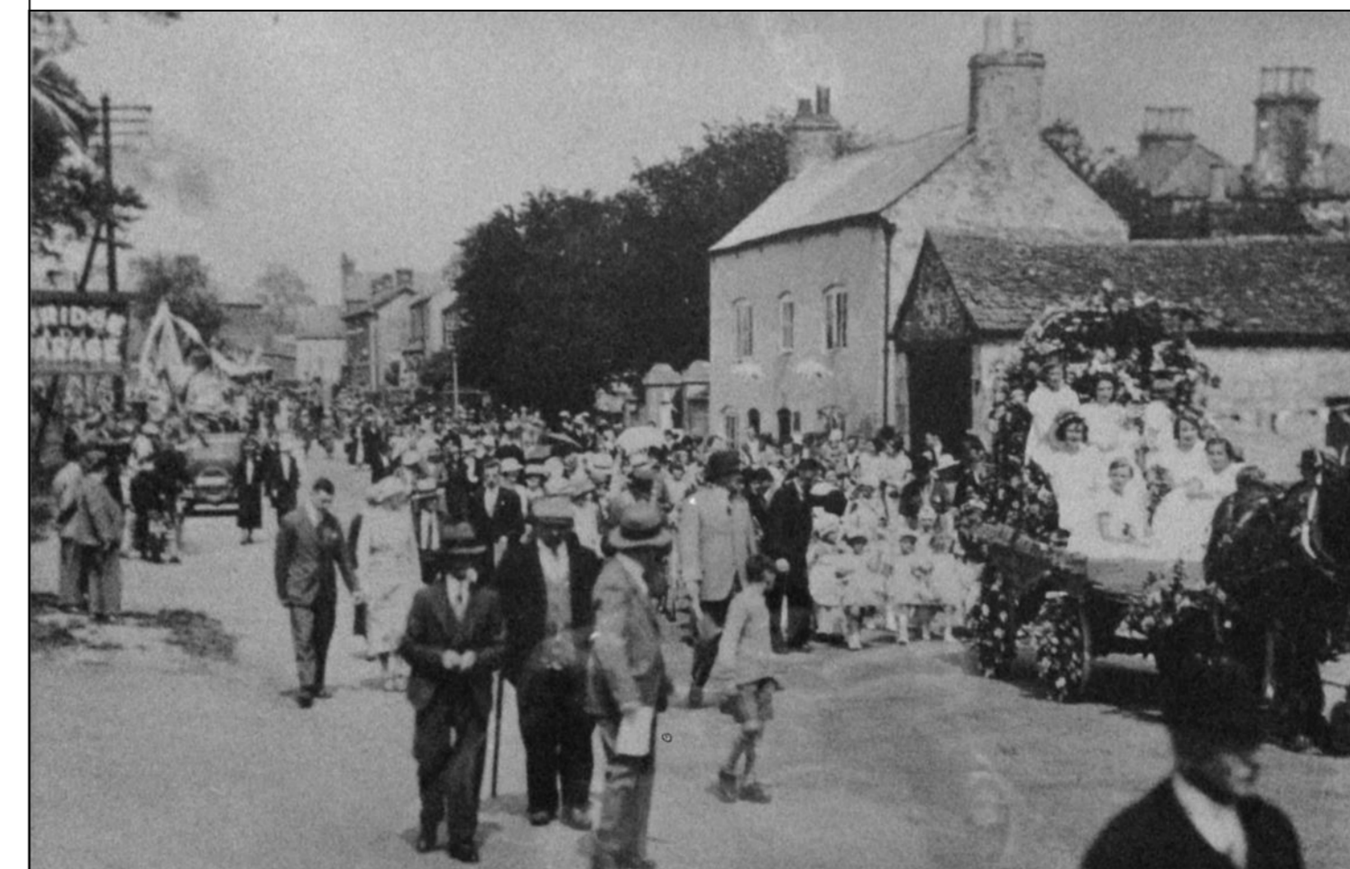
The Carnival Procession on Gloucester Road.

There were celebrations for the Silver Jubilee of King George V and Queen Mary in 1935. A full programme included a Carnival Procession, sports events, a Concert Party and a Dance at the Subscription Rooms, and a firework display in Verney Fields followed by lighting the Beacon Fire on Doverow Hill.