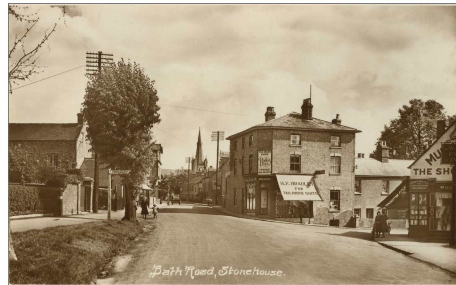
Bradley's Tailoring for men