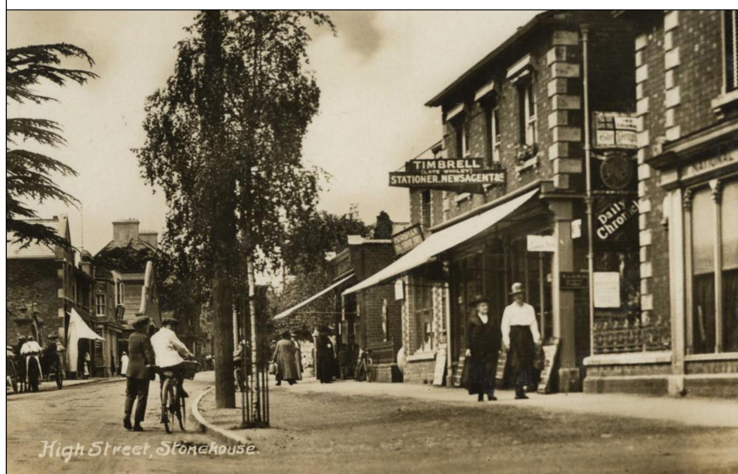
Timbrell Stationer and Newsagent