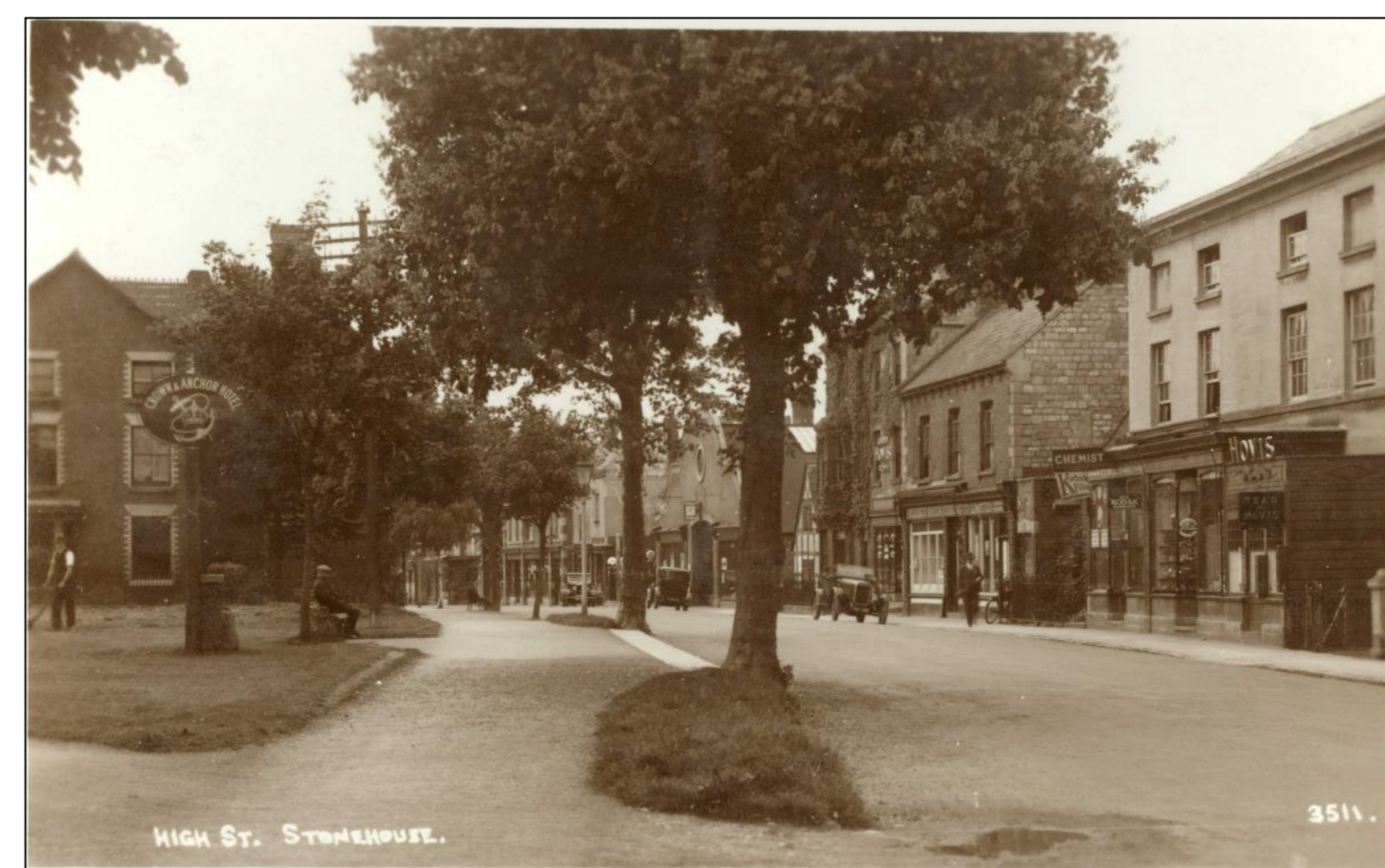
Cake shop, Hillier's bacon curing, Chemist