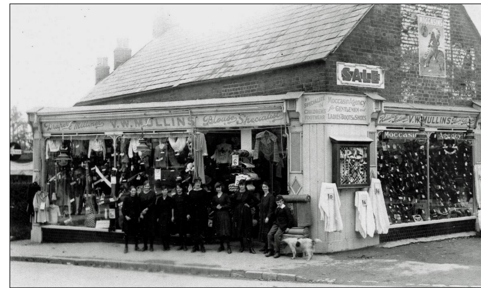
Mullins Haberdashery Store