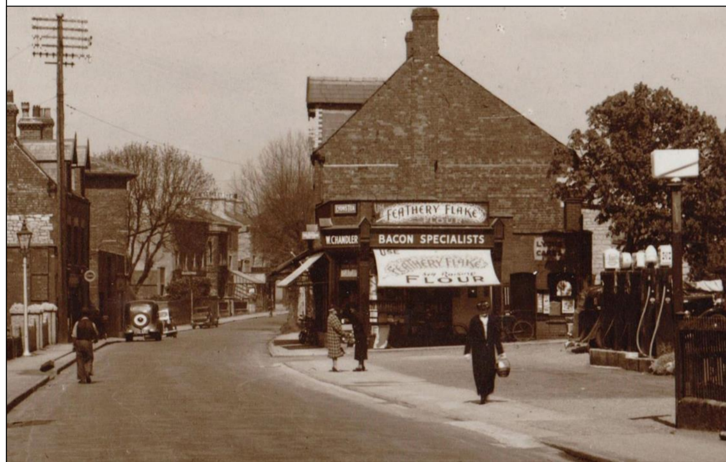
Chandler's grocery store

Stonehouse was resilient as many of the shops kept going through the war and as the men returned home new shops appeared in the village. These shops were independent and individual, and much of the fresh produce sold in them was supplied from local farms and nurseries. The three railway stations made it easy to bring in other goods from further afield, which brought people in from the surrounding area.